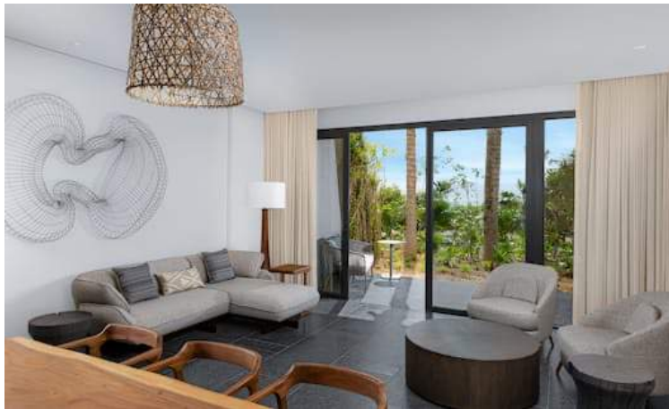
Tropical view suite with king bed $18,900 USD / 2 px