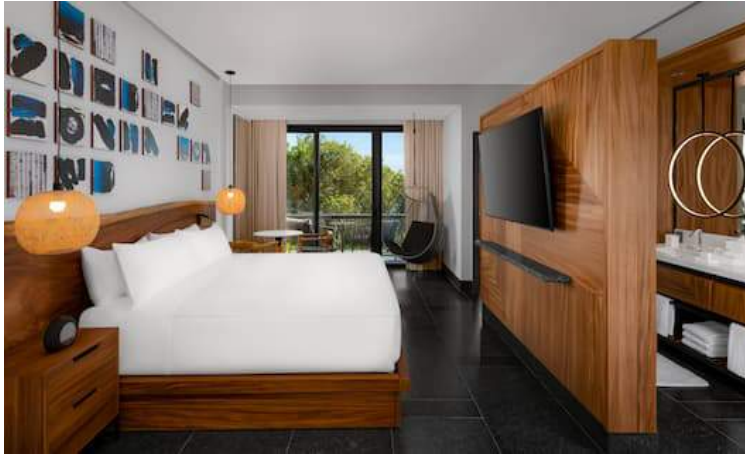
Tropical view king bed $12,900 USD / 2 px