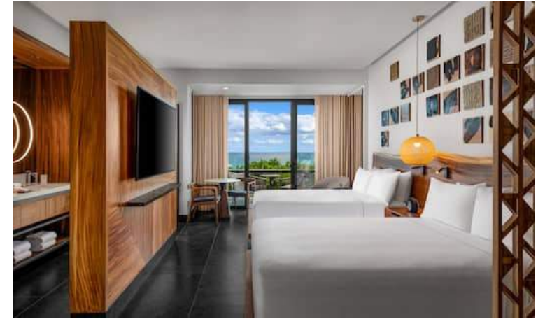
Ocean view king bed $14,900 USD / 2 px