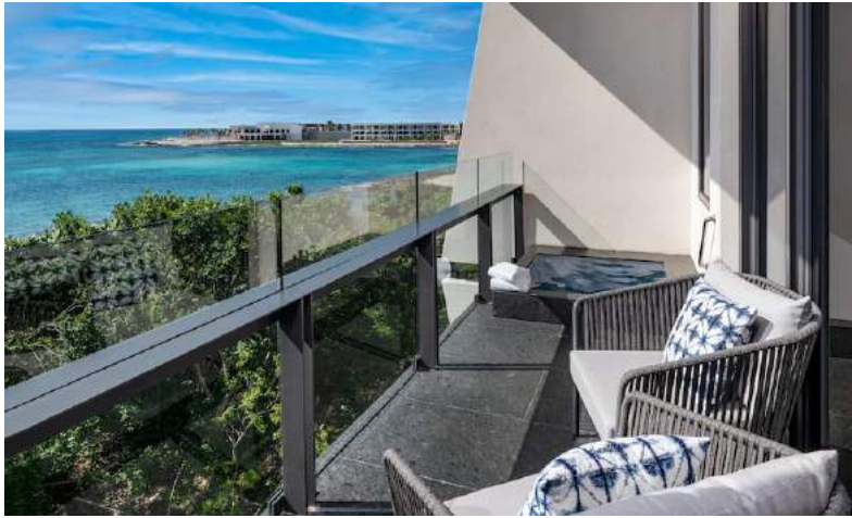
Ceiba governors suite 1 king bedroom $27,000 USD / 2 px