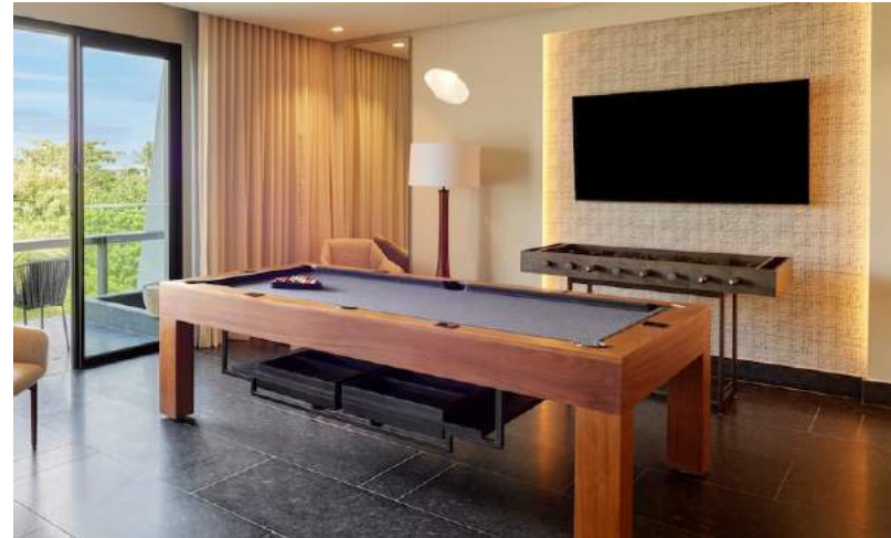
Ceiba presidential suite 1 king bedroom $35,000 USD / 2 px

The prices indicated are for two people per room for 10 days.