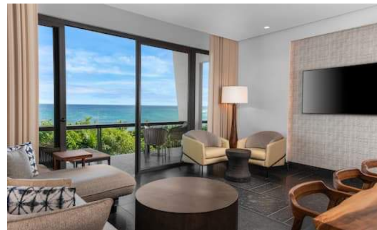
Ocean view suite with king bed $20,900 USD / 2 px