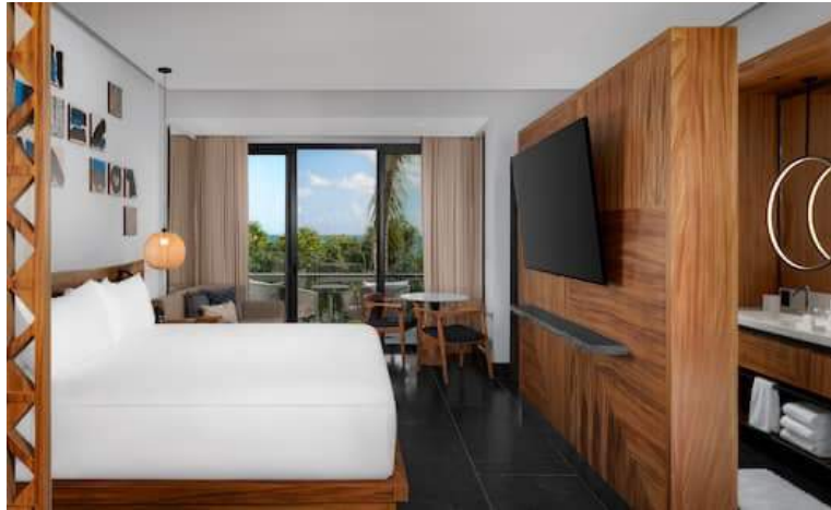
Partial ocean view with king bed $13,900 USD / 2 px