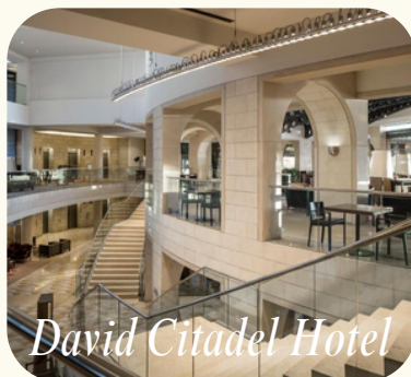
David Citadel Hotel